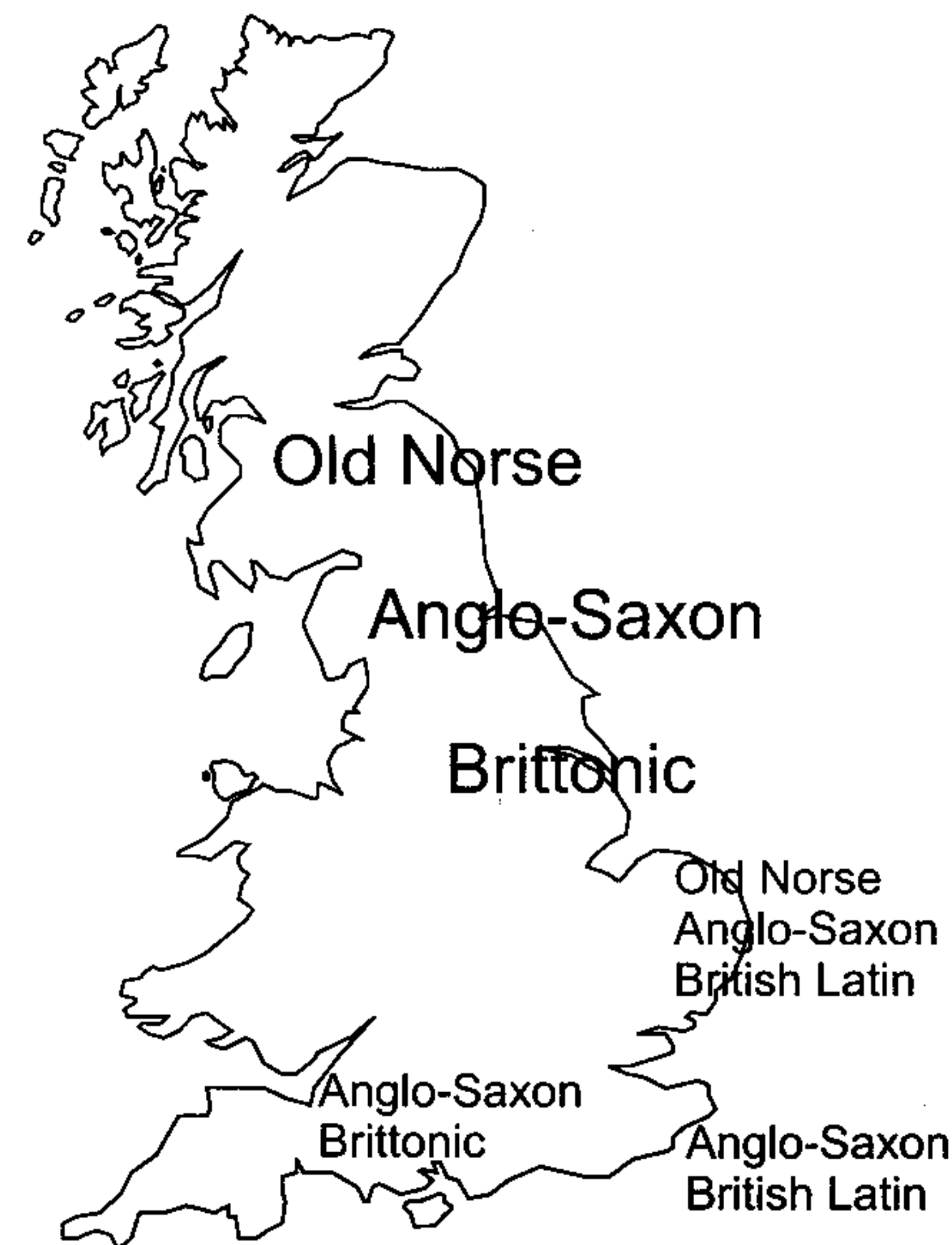
Fig. 2. Four contact zones

The languages spoken in sub-Roman Britain were British Latin in the British Lowlands, Brittonic in the Uplands, Wales and Cornwall, and Pictish north of the Clyde – Firth of Forth line. British Latin is likely to have been strong in the Lowlands, particularly in the east and south east (Schrijver 2002).