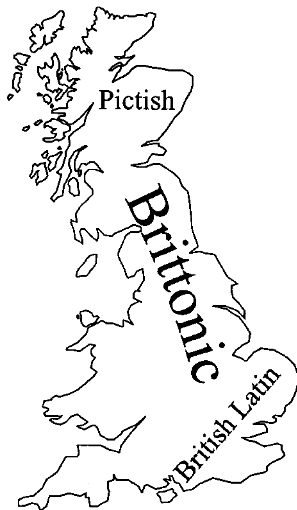
Fig. 3. Late Roman Britain

ZONE 1: In some areas of the Midlands and Northern zone, speakers of the post-conquest Anglian and Mercian dialects ruled the native population of the Britons as their slaves. These continued to speak Brittonic, their native language, for perhaps as many as six or seven generations (see the evidence of the Cædmon story for the North), before they shifted to Old English. Gelling (1993: 55) allows for more than four hundred years of the shift from Brittonic to Old English to have been completed and suggests that the process was only complete around 900 AD. During the process of shift, the Britons modified their target language by grammatical transfer from their native language (starting by imperfect adult learning). The main transfer from their source language consisted in the attrition of the inflectional endings in the NP, as Brittonic had already shed these before the advent of the Anglo-Saxons. The speakers of Brittonic compensated the loss of their inflectional morphology by means of rigid word order constraints and by the grammaticalized use of prepositions or other particles which lent the NP a very obvious analytical character. These shifters and now speakers of modified Old