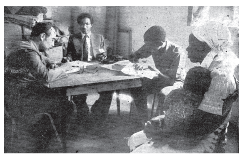
Image 3. A mother's trial, during Operation Production.