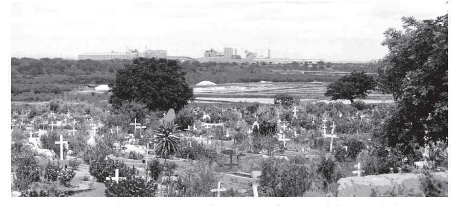
Image 1. Matola cemetery, near the river, a salt-pan and the Mozal plant.

He told me it was not true, and we debated for a while the reasons for that new rumour, which derived from the local belief in snakes possessed or owned by spirits (Granjo 2008a). But since those 'special snakes' are supposed to live in places with special characteristics, our conversation led me to the unusual Matola cemetery, nearby the smelter (Image 1). "That's a bad graveyard, isn't it? I mean, just near the river, which even overflows...," I asked.