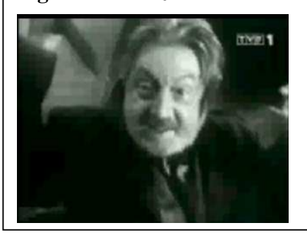
Figure 4. Mistrz as Macbeth

My own attempts at "interacting with native speakers" of German were rather modest, but quite interesting. Spurred by the self-didactic success of "Der Untergang", I obtained a copy of the 1966 Polish film Mistrz ('Master'). The plot of this highly acclaimed film (originally a theatre piece) is set in a cellar of a Nazi-surrounded house in 1944 Poland. Hostages are selected for execution from among two dozen people: only intelligentsia will do for the Nazi officer. An old actor, ausweised as 'Buchhalter' (accountant) must prove that he is indeed a Schauspieler (actor), if he wants to keep his dignity. Challenged to say 'Macbeth' by heart, he does so, in German... He proves his worth and is executed half an hour later.